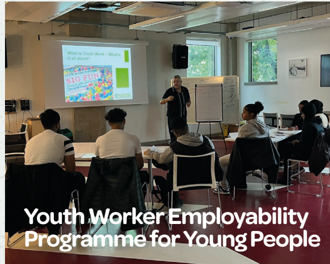
Youth Worker Employability Programme for Young People