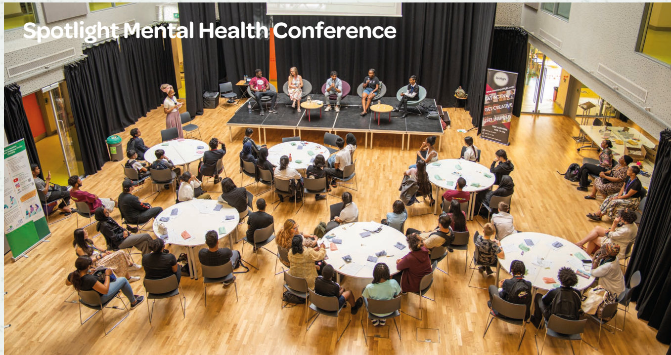
Spotlight Mental Health Conference