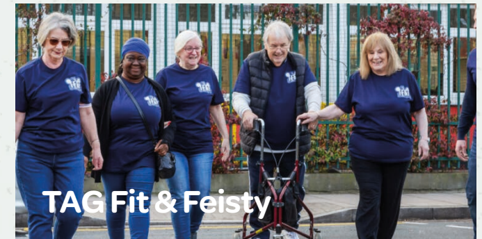
TAG Fit & Feisty