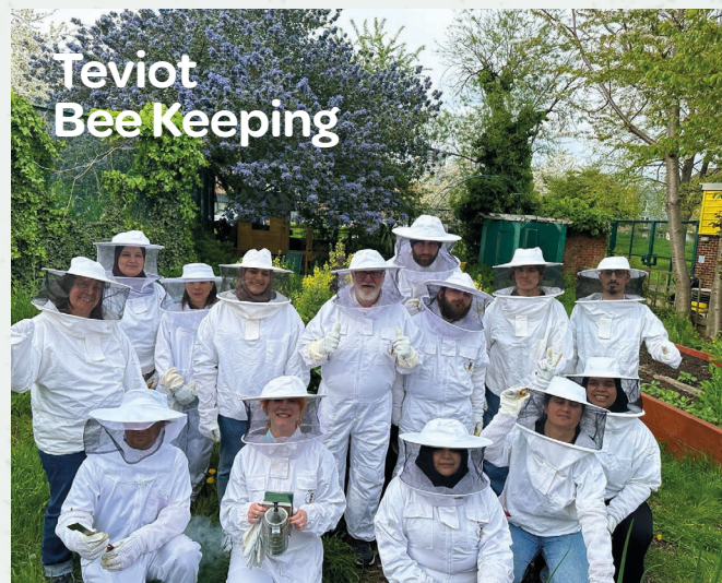
Teviot Bee Keeping