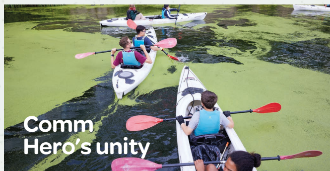
Comm Hero's unity